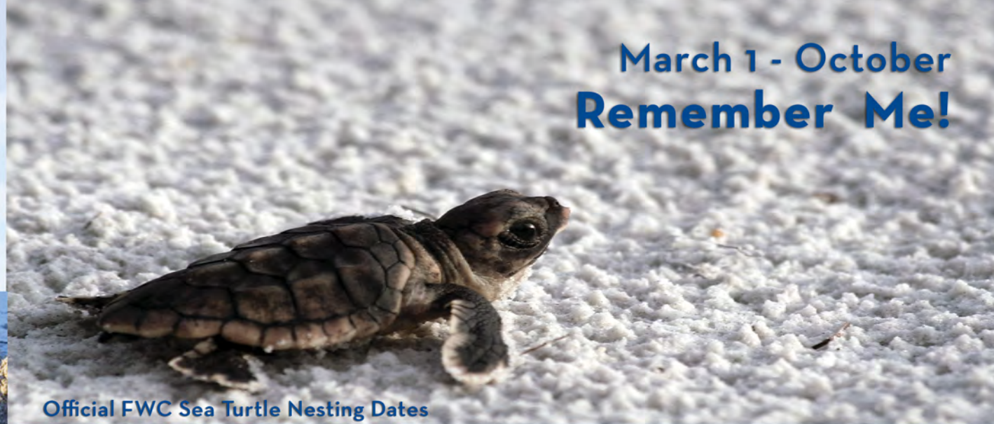
Official FWC Sea Turtle Nesting Dates